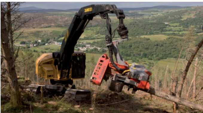
Figure 1 Harvesting operations in Dornoch.