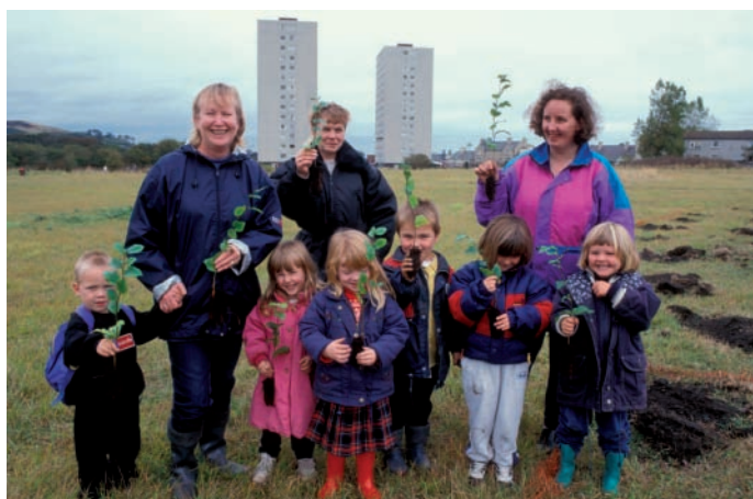
Figure 4 Mothers and their children taking part in a community tree planting event at Craigmillar urban forest in Edinburgh.

Arguably the most important benefit is the building of 'community capacity', a process which has been defined as activities, resources and support that strengthen the skills, abilities and confidence of people and community groups to take effective action and leading roles in the development of communities (Skinner, 2006). The focus of this theme is on the community woodland movement in Scotland, which is characterised by local ownership of woodlands, and/or control over woodland-related decision making. A high level of community capacity may be evident, for example, when a community woodland group works in partnership with a range of external agencies to bring in new sources of income as a means to realise shared goals (Evans and Franklin, 2008).